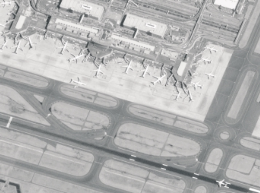
Figure 3: Part of a high-resolution (1m ground pixel) pan image of Haneda Airport, located on the west side of Tokyo Bay, 16km south of Tokyo, and showing the terminal areas and parked aircraft.