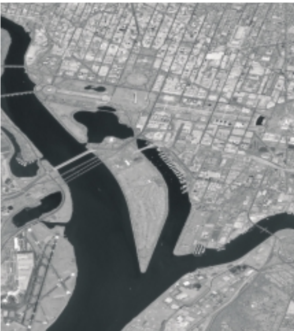
Figure 5: Part of a pan (1m ground pixel) image of Washington, D.C. covering the city's main downtown area, including the centre of the U.S. government with the Lincoln Memorial, the Washington Monument, the White House, and the Capitol building clearly visible.