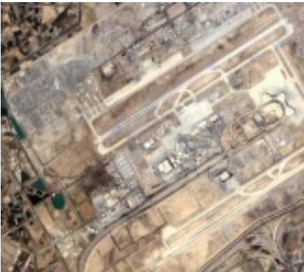
Figure 4: A multi-spectral (4m ground pixel) image of Baghdad International Airport. (Source: ORBIMAGE).